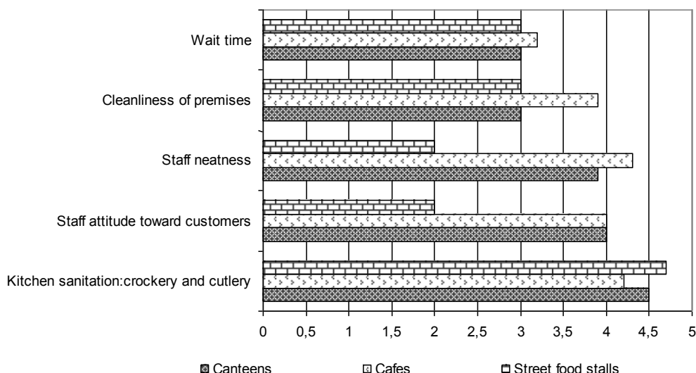
Fig. 2. Customer service culture parameters

Unskilled staff and seasonal job cause incompetence and poor service in dining outlets. That’s why the management of these establishments should change an approach while recruiting: hire employees carefully and thoughtfully, do training, cooperate with educational institutions which train future specialists in the customer service sphere.